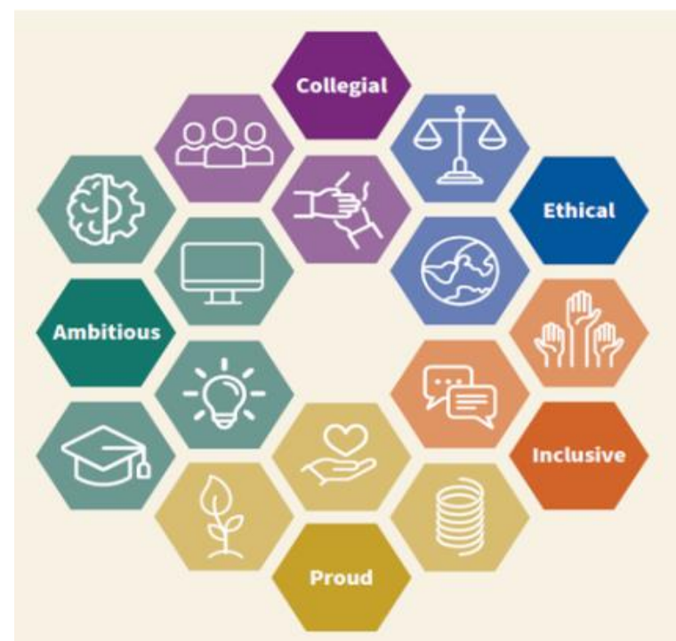
QMUL Graduate Attributes