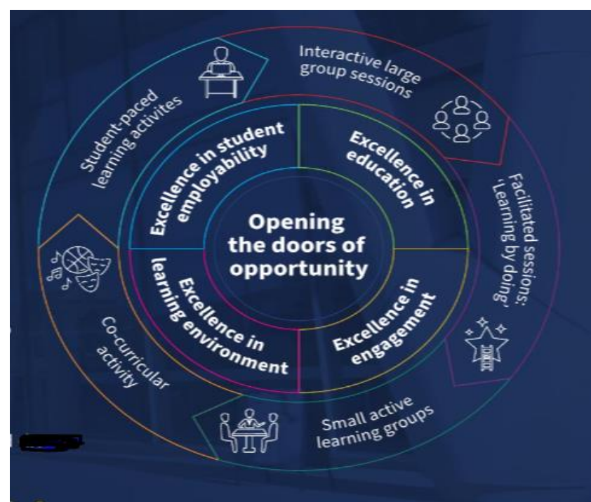
Active Curriculum for Excellence (ACE)